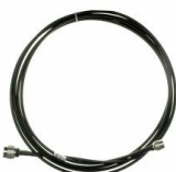
2 Antenna Cables